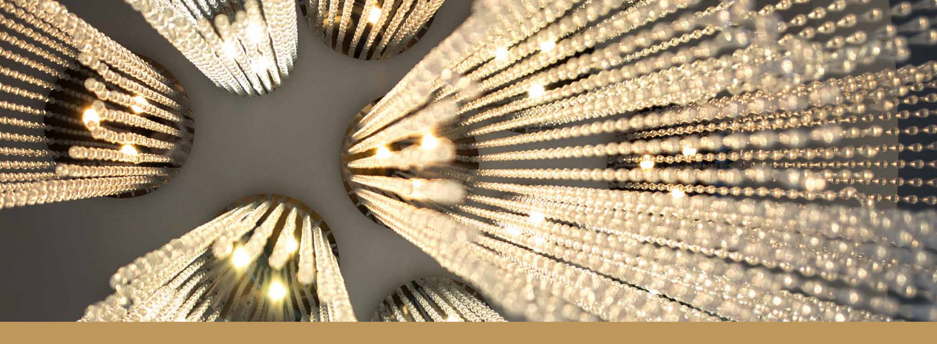
A dreamy setting for your perfect event