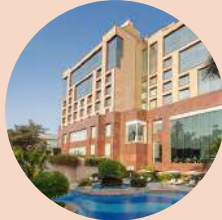
SHERATON, NEW DELHI

9987064456 / 9350137179 nitesh.kapoor@itshotels.in bharat.yadav@itshotels.in