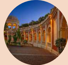
ITC GRAND CENTRAL

9870981160 / 9920059320 satyanarayan.mohonty@itshotels.in harshit.batra@itshotels.in